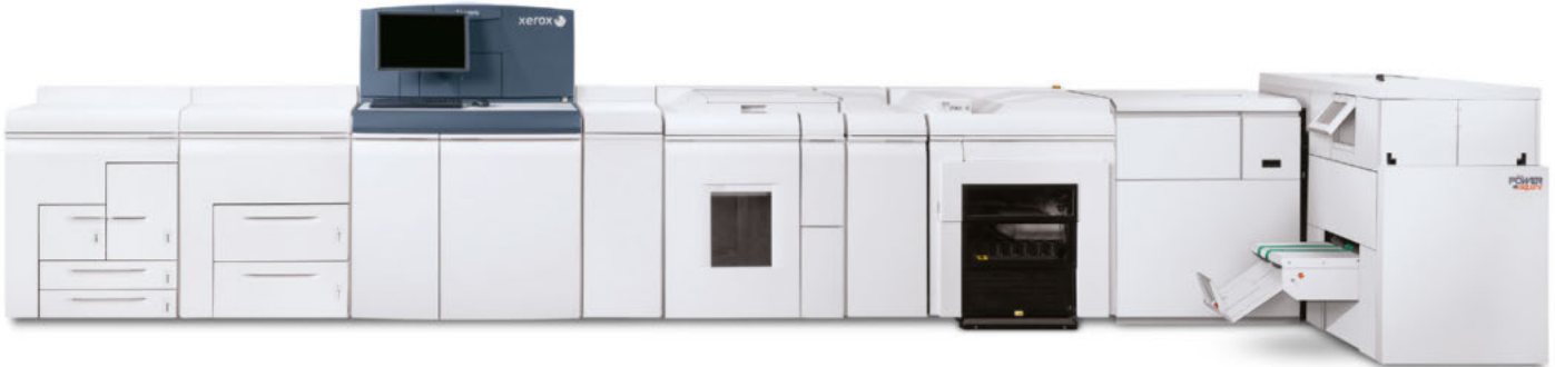
Xerox Nuvera® 157 EA Production System with Xerox® Production Stacker and Watkiss PowerSquare 200