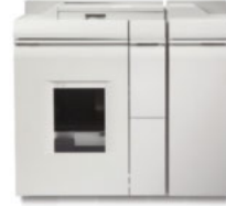
Basic Finisher Module Plus