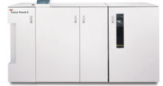
GBC FusionPunch II with Offset Stacker