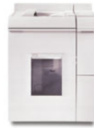
Basic Finisher Module