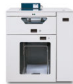
C.P. Bourg BSFx Dual Mode Sheet Feeder