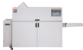
C.P. Bourg BDFNx Booklet Maker with Square Edge