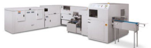
Xerox® Book Factory