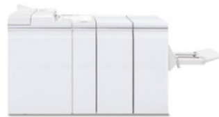
Plockmatic Pro 30/50 Booklet Maker (Available on 100/120/144/157 only)