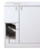
Xerox® Tape Binder