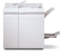
Multifunction Finisher Pro Plus