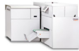
Watkiss PowerSquare 200