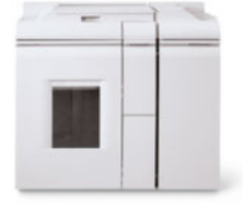
Basic Finisher Module – Direct Connect