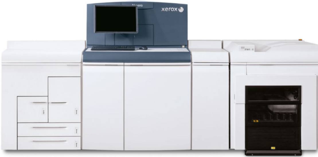
Xerox Nuvera® 157 EA Production System with Xerox® Production Stacker