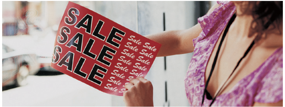
Xerox® NeverTear Window Signs

Our special polyester EA Low Melt Toner fuses the output to polyester using a proprietary chemical bonding methodology, ensuring superior image quality on specialty substrates including polyester and more. Our EA Toner including Premium NeverTear is water, oil, grease and tear resistant.